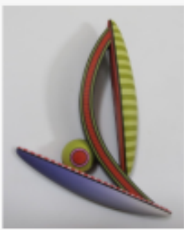
Brooch by D. Kato

This is Barbara's first video & was filmed in her studio with a class room style casual atmosphere. It is fast-paced and specific, featuring Barbara's popular recipe for Mokume using 22 kt real gold leaf and impression tools. All details for constructing the surface design are included in the video & several works are shown to illustrate possibilities for its use. A printed card is also included for visual and printed reference. The video is the first in a series geared toward an audience that is already familiar with working in polymer clay. It does not include basic conditioning and curing details. Future segments are being filmed that include general introduction to working with polymer clay, projects with polymer clay surface design and additional specific techniques.