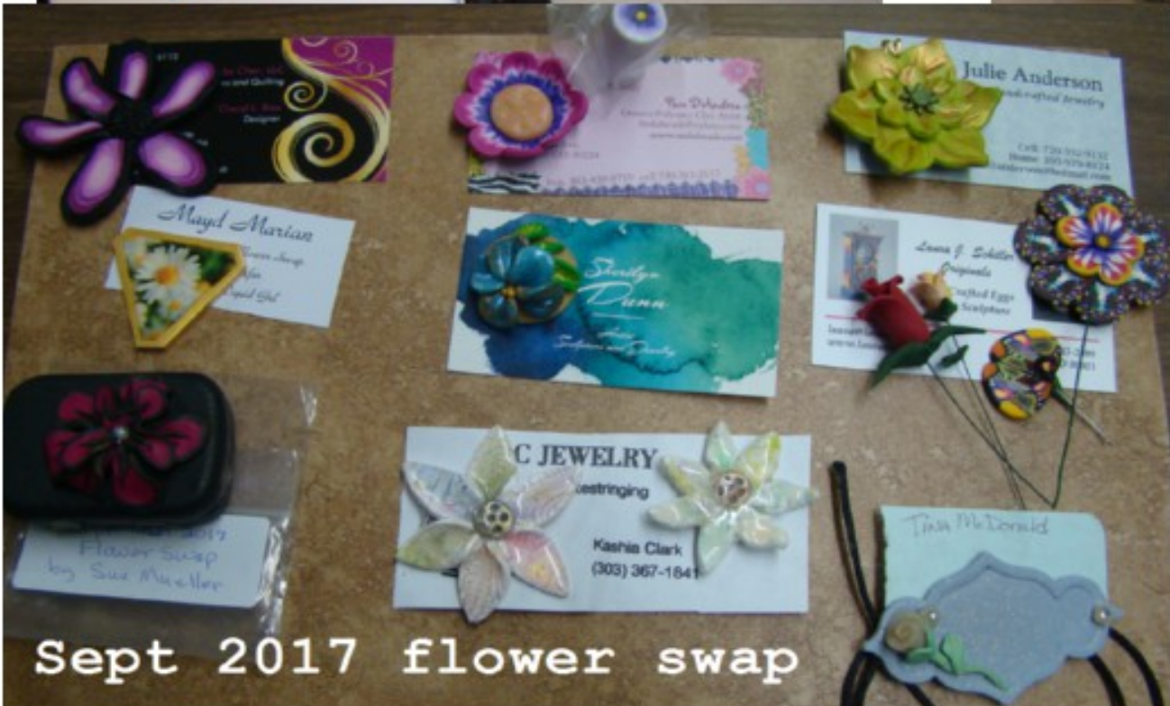
Sept 2017 flower swap