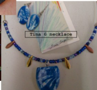
Tina G necklace