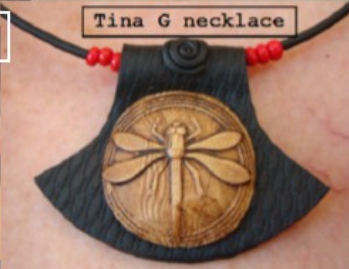
Tina G necklace