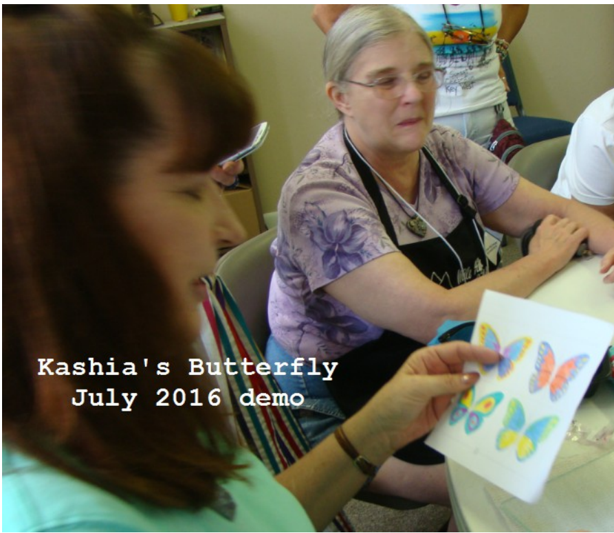
Kashia's Butterfly July 2016 demo