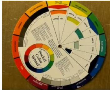
Using the color wheel

Diane Honegger gave a workshop entitled Working with Color and the Color Wheel