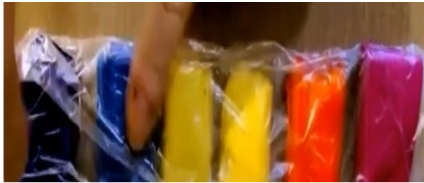
Mixing colors using warm and cool color hues and adding white to get a tint and black to get a shade.