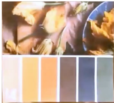
Making personal favorite colors and using in composition

We also had member sharing time during the retreat